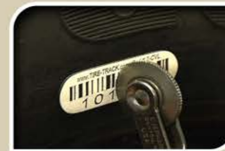
Stitch roll ID UNIT to remove any trapped air.