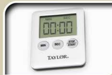
Set Timer for specified minutes (see TIMING CHART) and allow HeatClamp™ to "Cook" the ID Unit onto the tire.