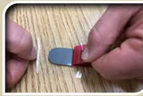
Place ID UNIT on 6" clear packaging tape to use as transfer, remove red backing.