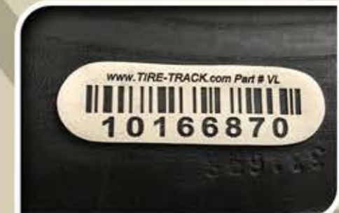
Remove HeatClamp™ and set tire aside until completely cool (approx. 15 min).