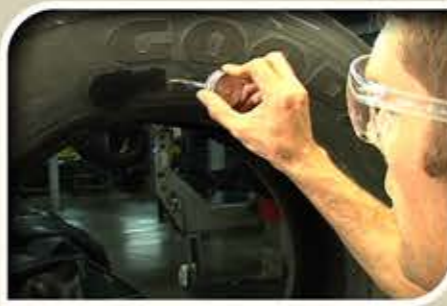
Apply thin coat of "Approved Clear Cement".