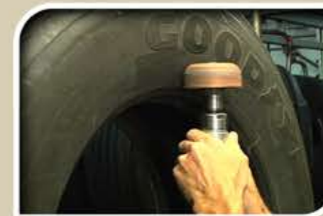
Use low speed buffer; buff area to "velvet-like" texture.