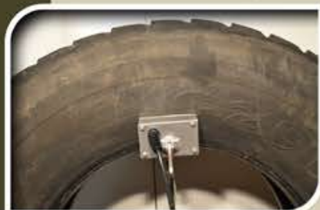
Lock HC onto tire so that it's extremely tight to the tire. HC should be "square" on tire.