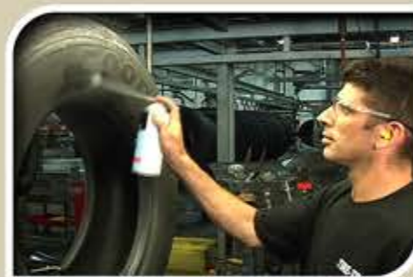
Spray with Tire Cleaning Fluid and allow to penetrate for 1 minute.