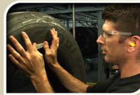
Allow Cement of completely dry, then place ID UNIT on tire. Press & smooth with thumbs.