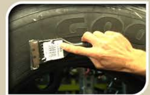
Brush area vigorously with wire brush.