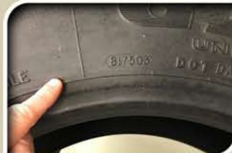
ID UNIT should be placed next to the D.O.T.#. It should touch the "Alignment Ring".