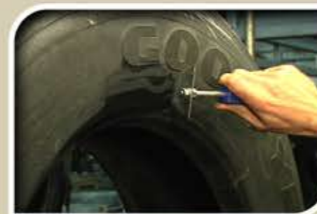
Scrape tire clean. Repeat steps 3&4 especially if tire is new.