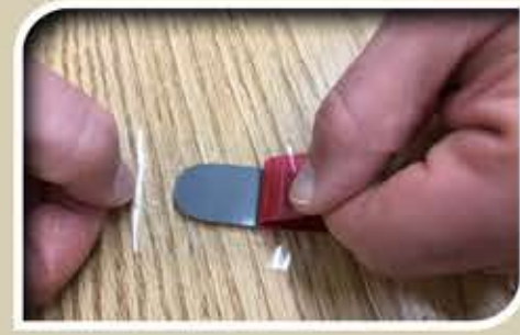
Place ID UNIT on 6" clear packaging tape to use as transfer, remove red backing.