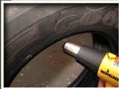
(OPTIONAL) Warm tire for 5 seconds.