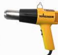
"Painters Heat Gun"

be placed, so that it follows the natural contour of the tire and the HC sits "square" to the tire. Squeeze the HC with enough pressure that it requires 2 hands to lock-down....tighter is better.