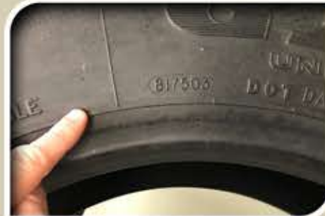
ID UNIT should be placed next to the D.O.T.#. It should touch the "Alignment Ring".