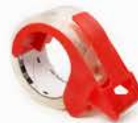
Clear Packaging tape