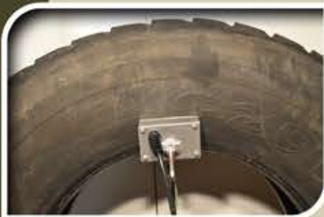
Lock HC onto tire so that it's extremely tight to the tire. HC should be "square" on tire.