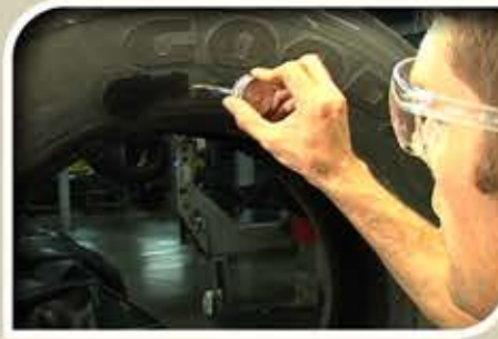
Apply thin coat of "Approved Clear Cement".