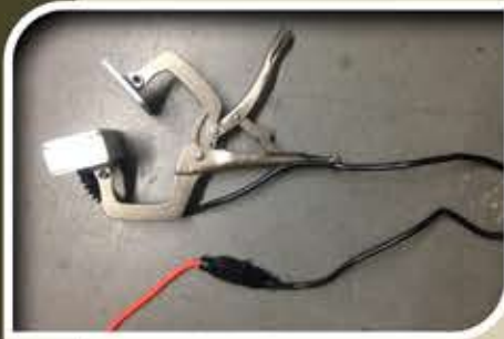
Plug in HeatClamp™.