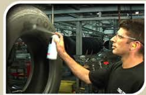
Spray with Tire Cleaning Fluid and allow to penetrate for 1 minute.